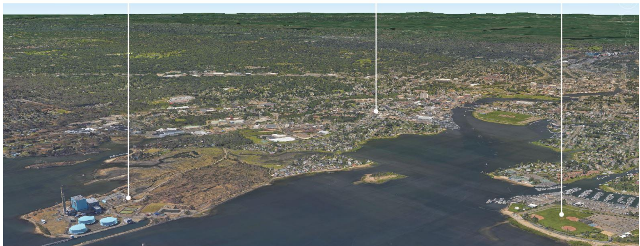
Calf Pasture Beach